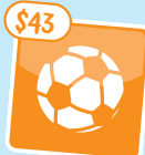
Soccer Balls for a School