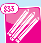
Pencils for a School

Give us a call at 1 800 308 3248 or email us at oct31@unicef.ca – we would love to help you brainstorm fundraising ideas and help you plan for a successful National UNICEF Day . Contact us today and we will take the guess work out of it all.