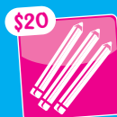
Pencils for a School

When it comes to giving children a brighter future, no child is too far. Please give here or online at unicef.ca/oct31 .