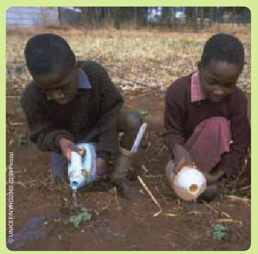
In Niger, community gardens nourish hope.

Nature is a series of balances but humans are impacting the natural rhythms of the planet; we are changing the natural global carbon cycle by excessively burning fossil fuels. "Forests, soil, oceans, the atmosphere, and fossil fuels are important stores of carbon. Carbon is constantly moving between these different stores that act as either 'sinks' or 'sources.' A sink absorbs more carbon than it gives off, while a source emits more than it absorbs. Before the Industrial Revolution, the amount of carbon moving between trees, soil, oceans and the atmosphere was relatively balanced." By burning oil, coal and gas, we have far more "sources" than "sinks" and this alters the natural balance.