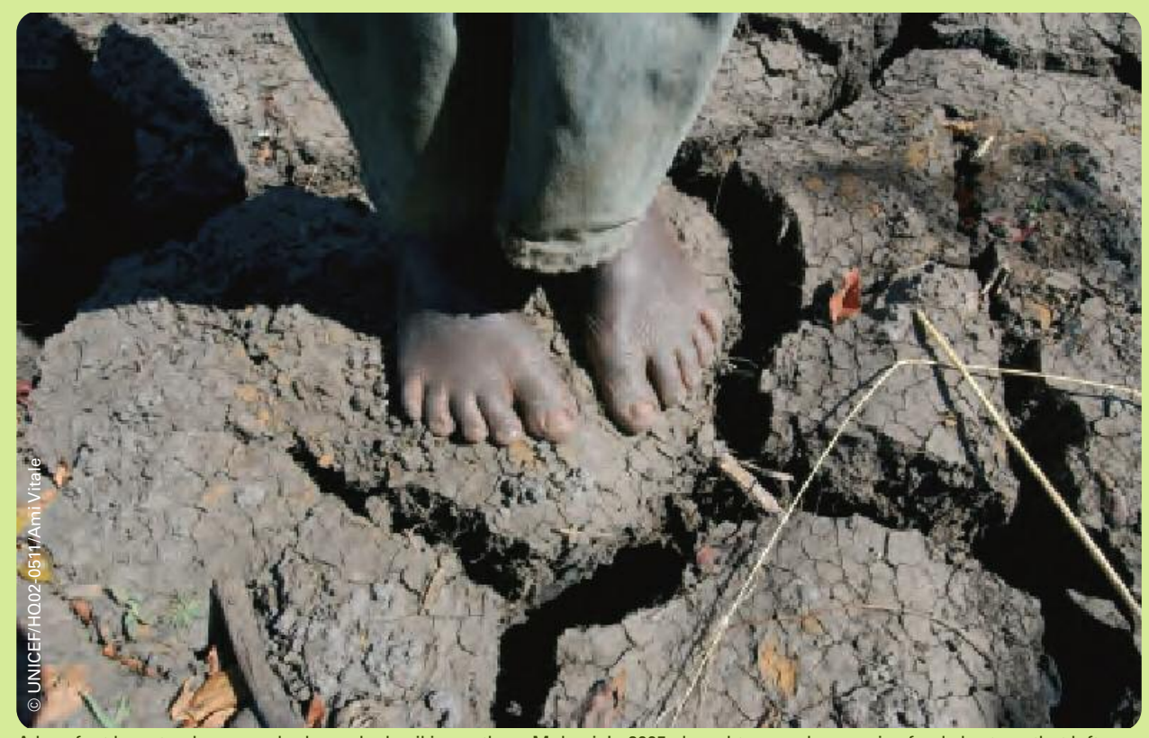
A barefoot boy stands on parched, cracked soil in southern Malawi. In 2005, drought caused a massive food shortage that left 4 million people without adequate food supplies.