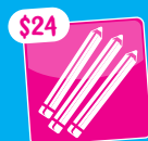
Pencils for a School

When it comes to giving children a brighter future, no child is too far. Please give here or online at unicef.ca/oct31 .