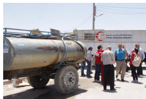
Water trucking for IDPs in Hasia, UNICEF, 2013