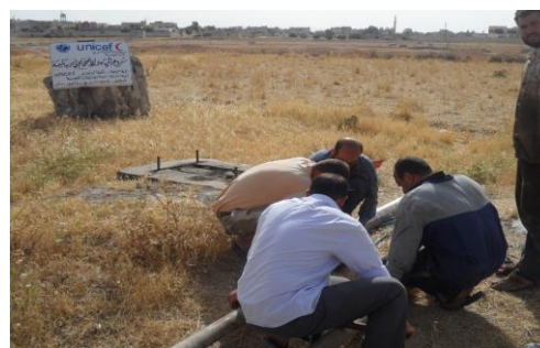
Rehabilitation of water and sanitation system (Talbiseh), UNICEF, 2013

Various forms of educational supplies were dispatched to five governorates last week, with 835 sets of school stationery along with school kits dispatched to Lattakia, Tartous, Aleppo, Hassakeh, and Rural Damascus – enough to benefit a total number of 83,500 children. In addition, 1,500 school supply kits for children and teachers were dispatched to the five governorates benefitting 60,000 children. A total of 350 recreation kits were dispatched benefitting 35,000 children. Further, 24 Early Child Development Kit (ECD) kits have been delivered to Homs and Hasia areas benefitting a total of 1,200 children below 6 years.