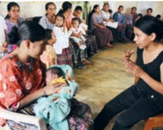
▲ A health worker talks with a woman who is breastfeeding her daughter at a health centre in Cobán Municipality, Guatemala.

Children and their communities have the right to be provided with information