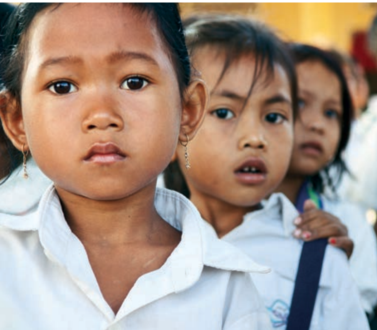
▲ Girls queue up at school in Cambodia.