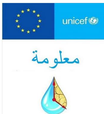
Messages on UNICEF WASH social media help to raise awareness of how to prevent and control cholera transmission