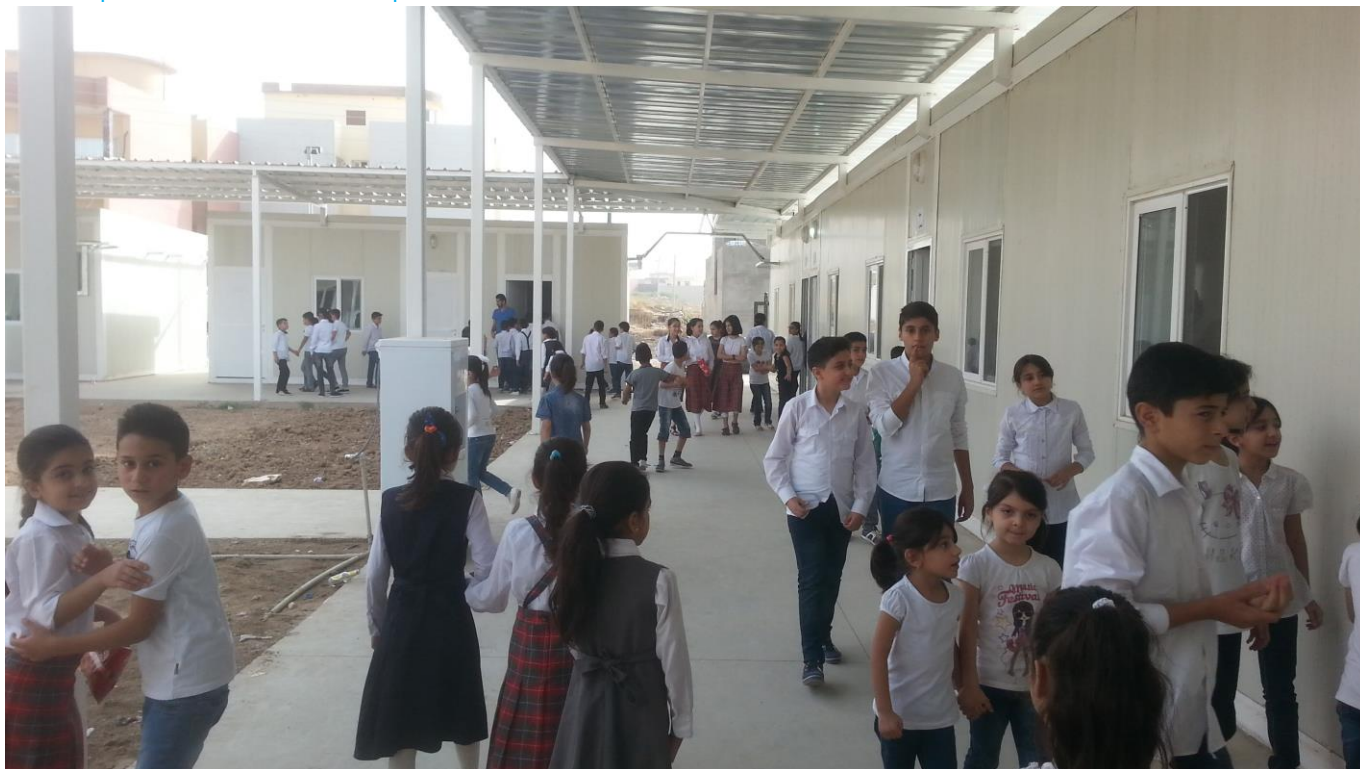
Children in the new UNICEF-supported prefab school in Masike host community, Dahuk Governorate.

Three new tented schools were opened in Dahuk. All classroom tents in Aliyawa camp school in Diyala have been replaced, as well as 60 tents making up 8 camp schools in Berseve, Qadia, Bajid Kandala 1 and 2, Sharia and Khanke, all IDP camps in Dahuk Governorate.