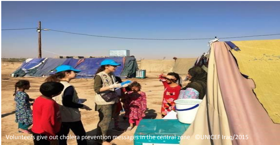
Volunteers give out cholera prevention messages in the central zone