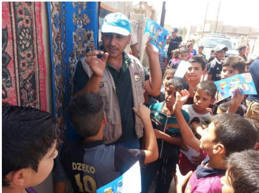
Children engage in awareness raising activities about cholera prevention and hygiene promotion in Iraq's central zone

The onset of cholera outbreak in the central and southern governorates since mid-September has exacerbated the already stretched WASH needs of IDPs and host communities in affected zones. IDPs are among the most vulnerable groups, as current WASH facilities remain inadequate in certain areas due to on-going construction and rehabilitation, in addition to many IDPs lacking disposable income to purchase necessary items to support good hygiene practices.