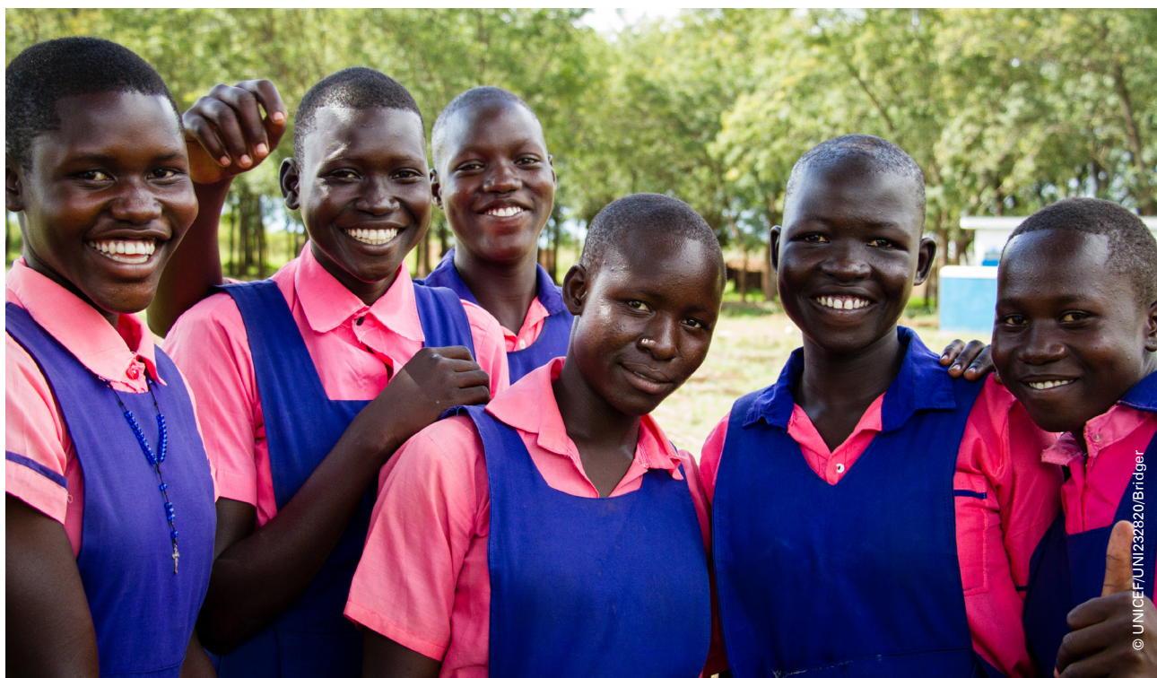
Adolescent girls from Umwia Primary School in Adjumani.

The generosity of Halifax donors is helping to change lives in communities in Uganda. Although the in-person 2021 Chefs for UNICEF Water for Life Gala was cancelled, our supporters rallied to raise over $75,000 , which is an extraordinary achievement. By working together, we are helping to make clean water and education a reality for every child.