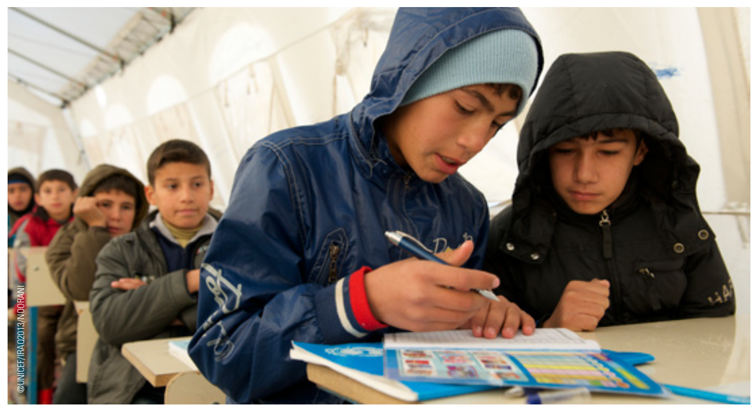
Boys study at a UNICEF-supported tent school in the Kawergosk refugee camp near Erbil, Iraq.