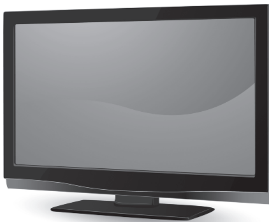
A television set