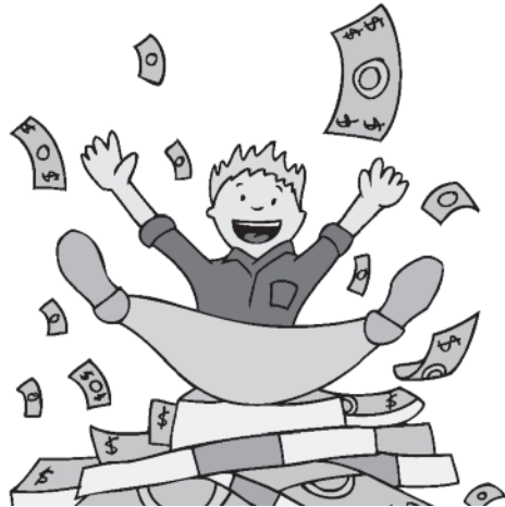
Money to spend as you like