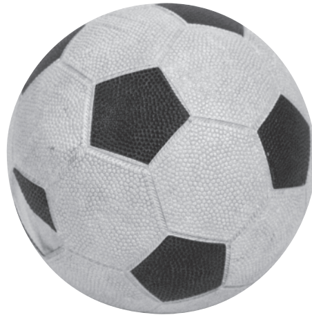
Playgrounds and recreation