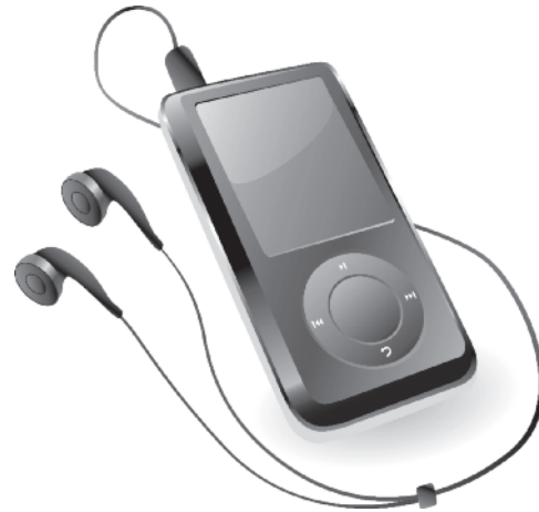
A personal stereo