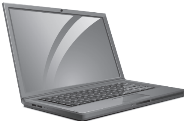
A personal computer