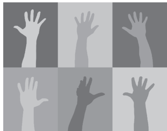
Opportunities to practise your own culture, language and religion