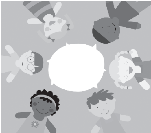
Opportunities to share opinions