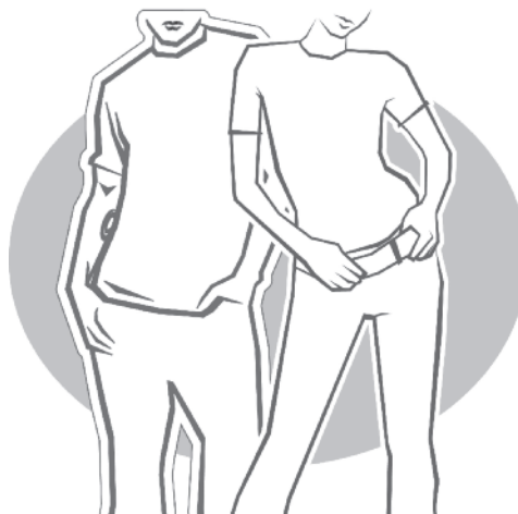
Clothes in the latest style