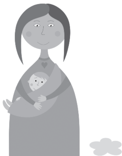
Protection from abuse and neglect